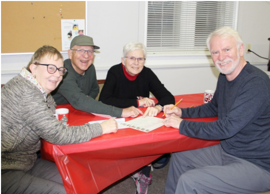
Yes, we're having fun!