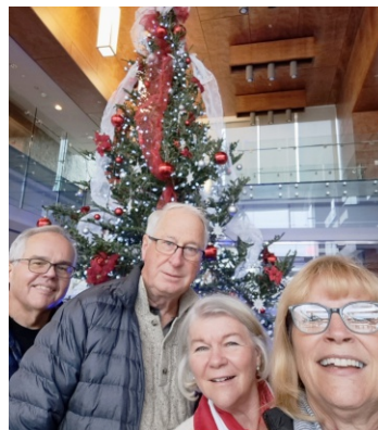
Oh Christmas Tree!