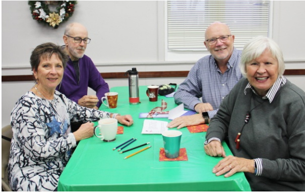
What a team!