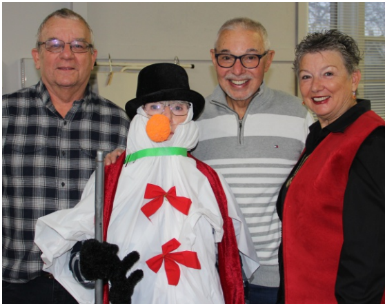
Also looking good!