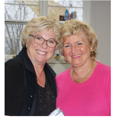
Need we say anything?