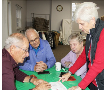
Focus people, focus!