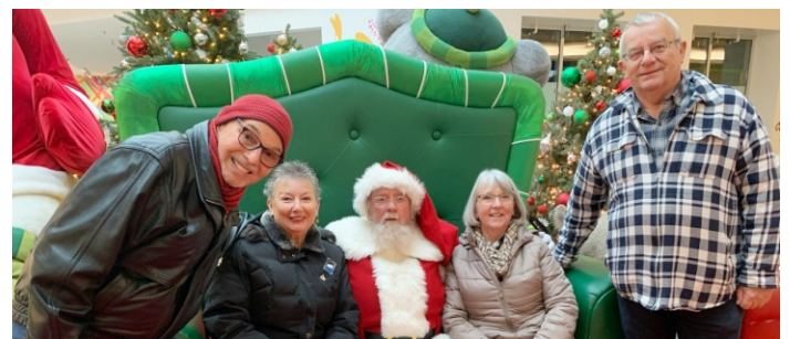
You are never too old to have your picture taken with Santa