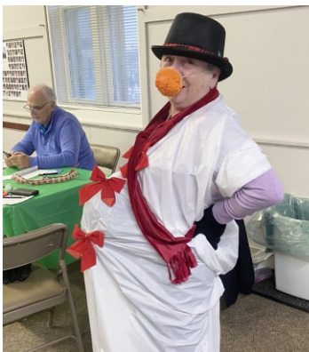
Hmm ... a frosty relationship has a different meaning here